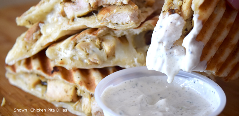
Shown: Chicken Pita Dillas